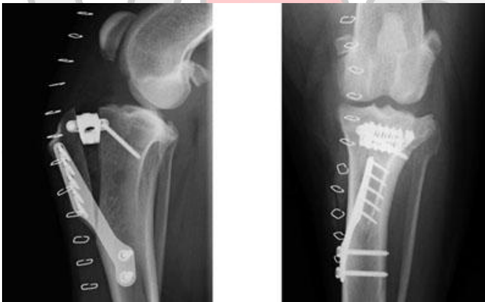
Figure 2. Stifle joint X-ray after having a TTA performed.